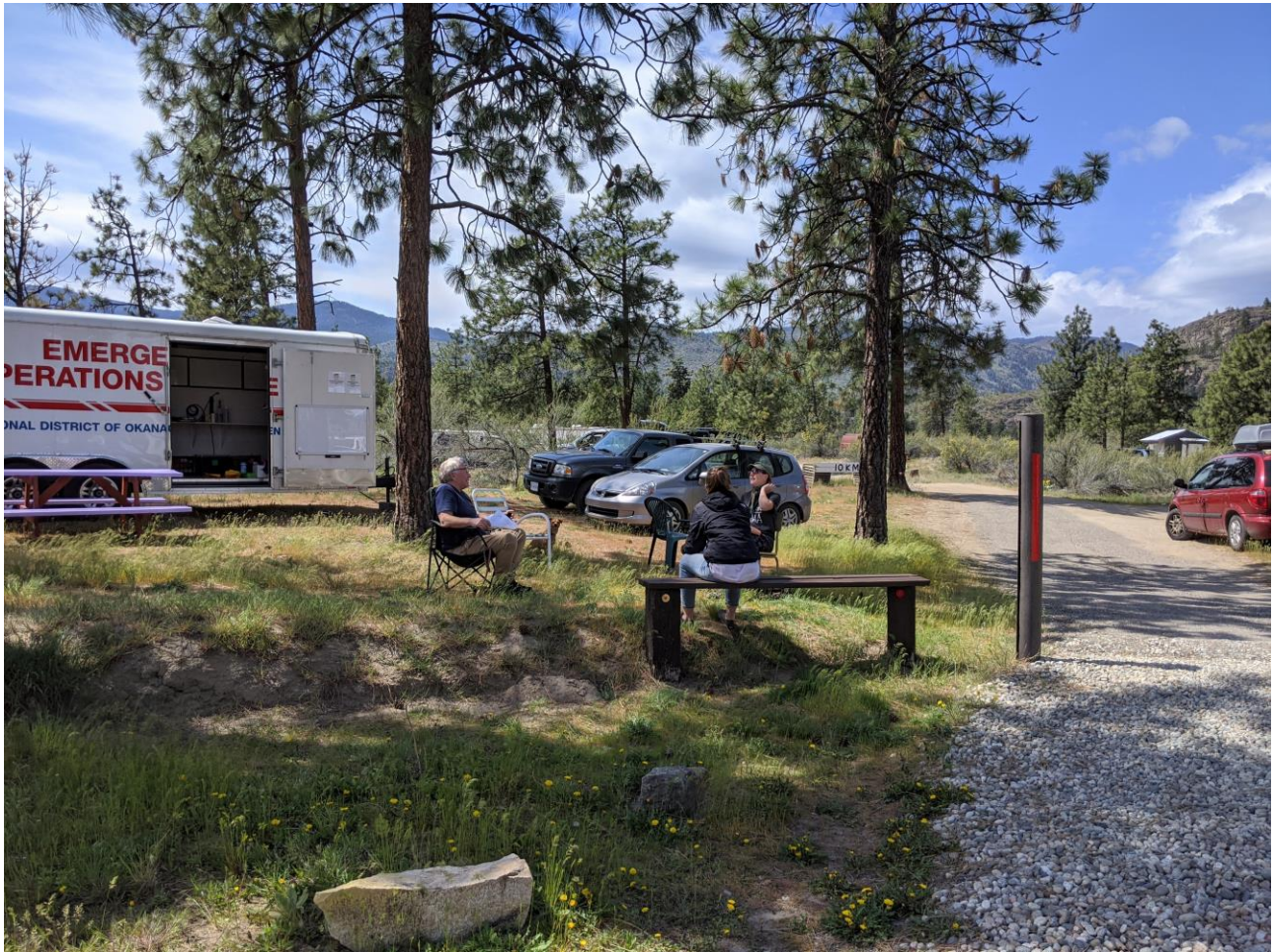
Loose Bay Campground Orientation