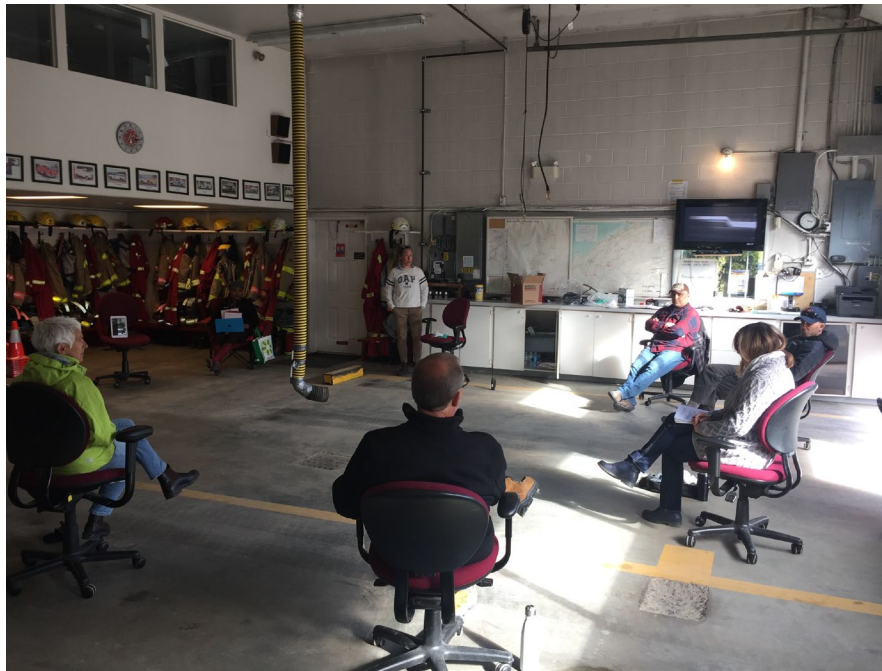
Kaleden Fire Department Occupational Health and Safety Committee practice physical distancing during meeting.